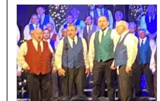
PI Chapter Quartet – AT LAST