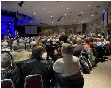
Sold-out audience of more than 700!