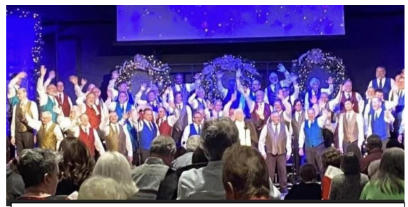
We Wish You a Merry Christmas and a Happy New Year!